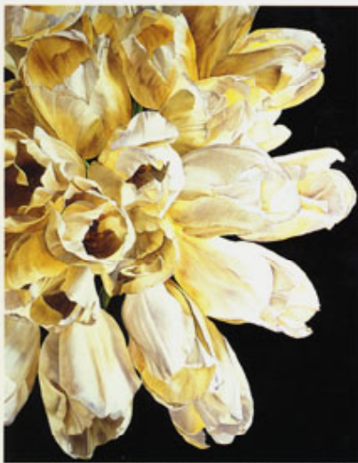
"White Harvest" by Sandra Sallin (oil on canvas) began with a powerful vision that stunned the artist—luminous white tulips among dark evening shadows.