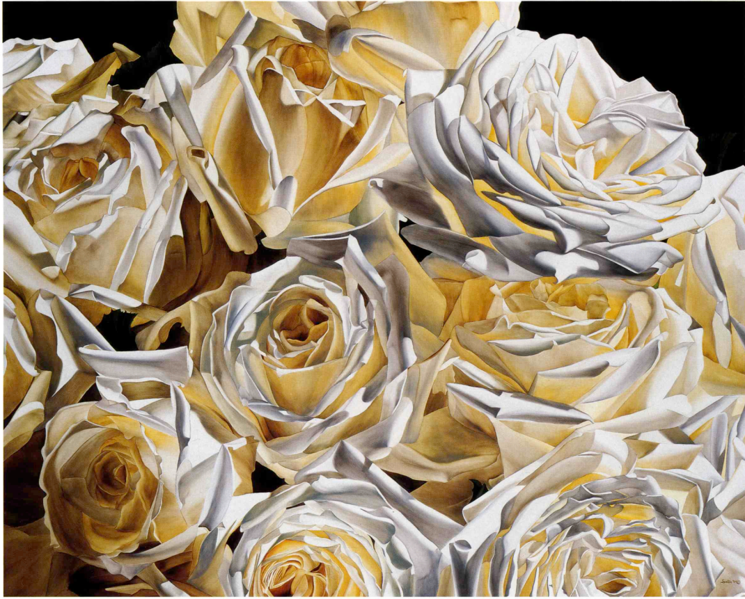
"SHADOWS" Sandra Sallin Oil on canvas over panel, 30" x 37½" (76cm x 95cm)