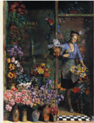
The classic sentiment of Joseph Sheppard's "Fior da Rita" was inspired by the flower shops of Italy, and painted life size in oils on canvas.

Big, blooming reproductions are accompanied by the artists' own stories behind the paintings, in which they share their inspirations, creative concepts and painting techniques.