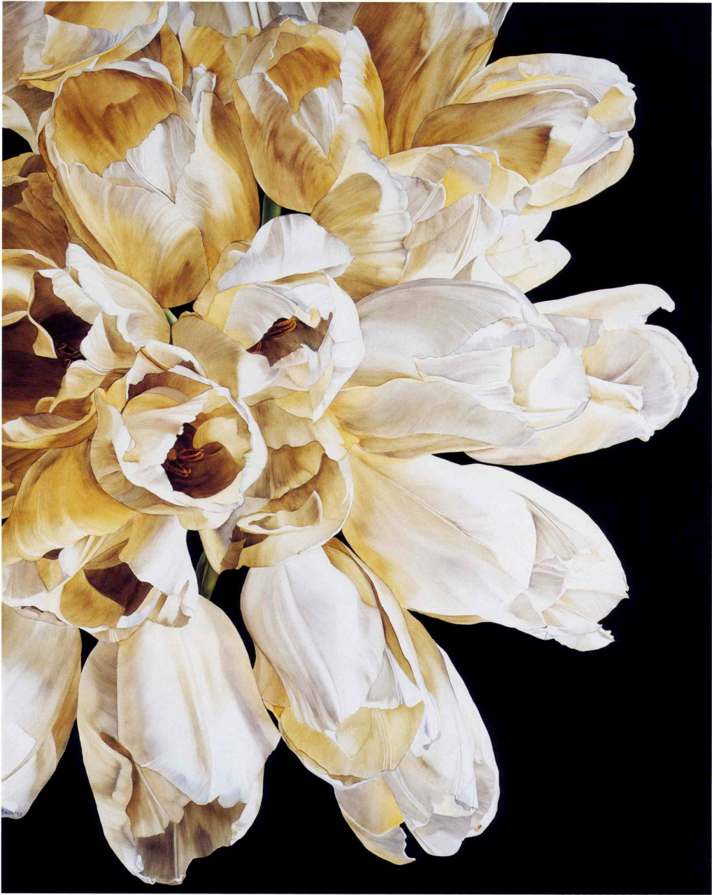
"WHITE HARVEST" Sandra Sallin, Oil on canvas over panel, 30" x 24" (76cm x 61cm)